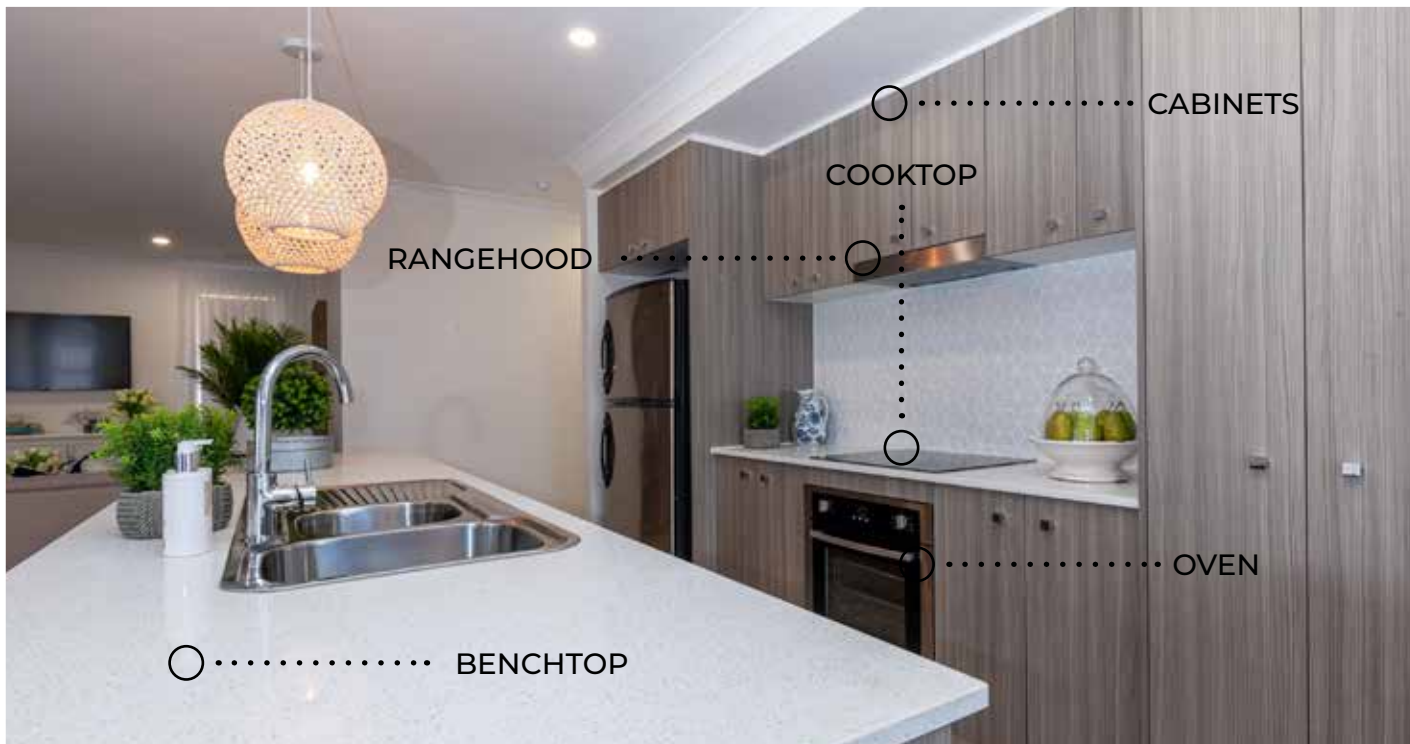
*Images are for presentation purposes only and may not include everything in the image.