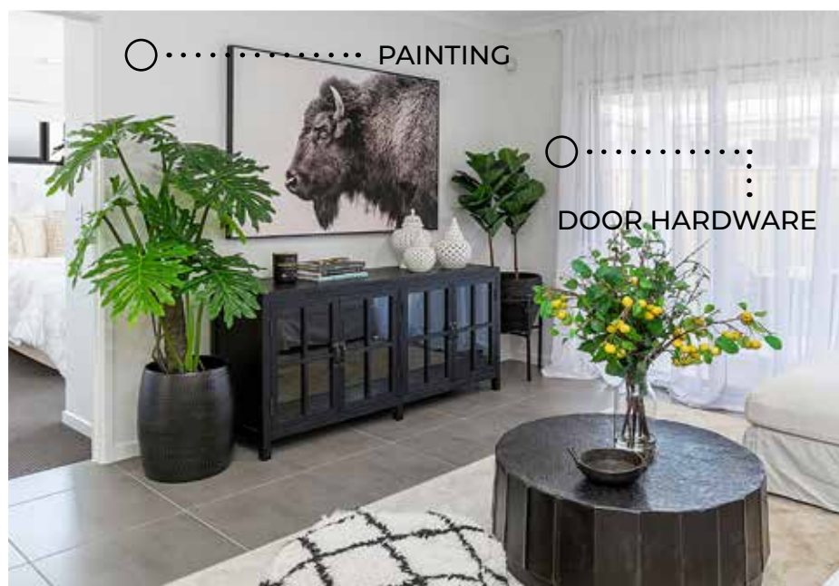
*Images are for presentation purposes only and may not include everything in the image.