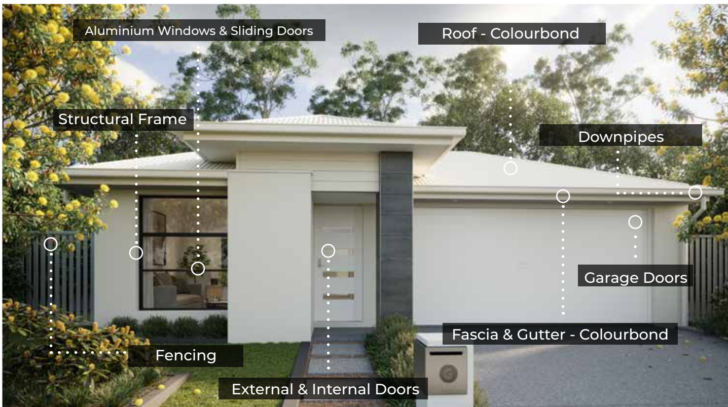
Gallery Homes Pty Ltd may not inspect works after the expired dates. If an inspection is carried out and works are found not to be the responsibility of the builder, then a callout fee may be charged. *Images are for presentation purposes only and may not include everything in the image.